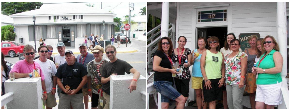
We came, we saw, we partied (with a purpose)...and we left a reminder we were there at Captain Tony's Saloon!