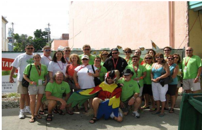
26 Registered club members attended the annual PHIP convention in Key West, Florida the first weekend in November, 2009!